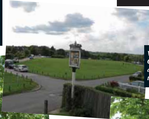
Winchmore Hill Common taken from an upstairs window of the Potters Arms