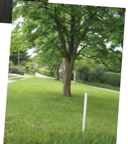
Forty Green – The tiny remnant of the original 4 acre green of Forty Green which now lies in private hands behind the hedge to the right