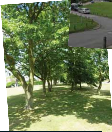
Penn Common – A row of oaks was planted in 1960, each one contributed by a Parish Councillor. A parallel row of limes was planted in 1979 to belatedly mark the Queen's Silver Jubilee. The two rows are too close together and some thinning has been needed