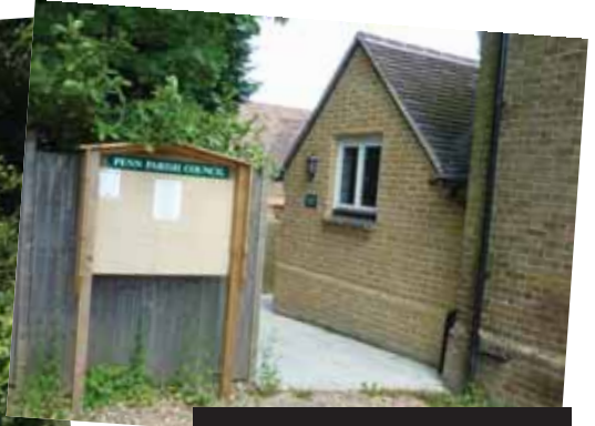
Parish Office – This is the way in to the new Parish Council Office behind Penn Church Hall