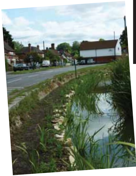
Widmer Pond – The water-level bank was badly eroded by ducks and people. It has been rebuilt with a Purbeck stone edge