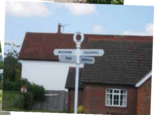
Three parishes, Amersham, Coleshill and Penn, used to meet at this point until an agreement in 1959 redrew the boundaries to put all Winchmore Hill in Penn