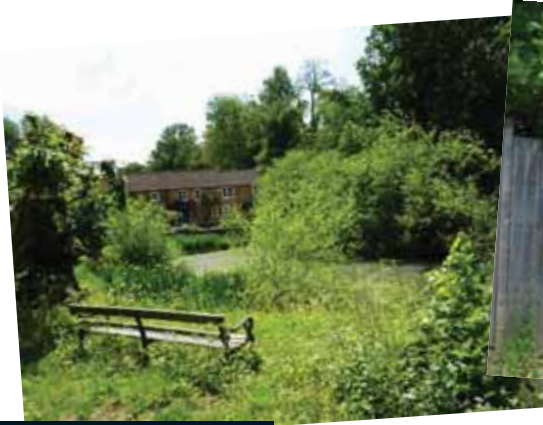
Pistles Pond – This pond takes its name from a farm called Pissulls, first recorded in 1332. It means Peas Hill i.e. the hill where the wild peas grew